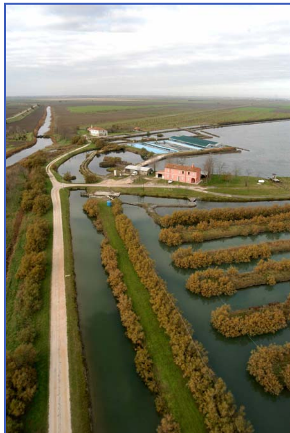
Figure 1: Vale Bonello – Valliculture (Italy)

The project is based on case studies covering a wide variety of production systems and geographical locations (Portugal, Spain, France, Italy and Greece). Traditional extensive and semi-intensive coastal Aquaculture systems in Southern Europe are facing difficulties, especially due to the increased competition for coastal areas by other candidate users and market competition, due to decreasing prices of intensive aquaculture products. By promoting this type of Aquaculture, the project aims to contribute to a better management of coastal areas of particular ecological interest, support sustainable production and create employment opportunities/security in rural zones.